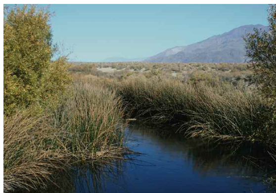
The Lower Owens River re-watering project is restoring a portion of the ecosystem.