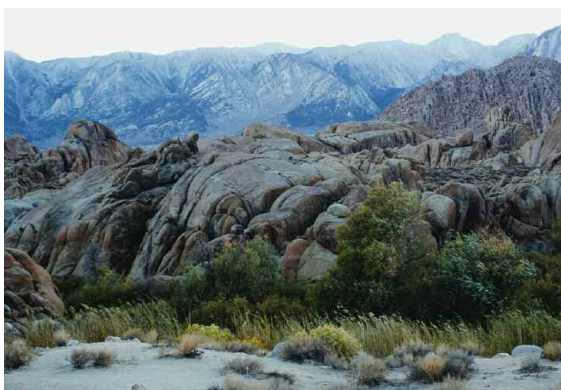
The ancient rock formations called the Alabama Hills have been the setting for numerous western films and television series.