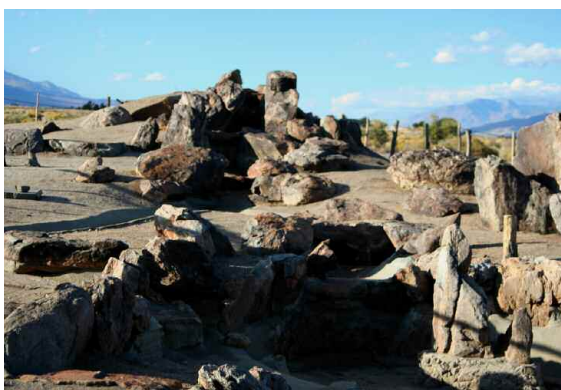
The Mess Hall Garden at Manzanar.